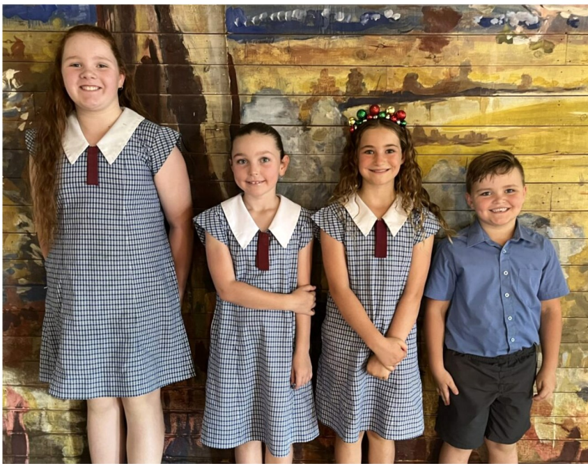
BELOW: Dance Club 'The Three Stars' put on a fantastic performance to close out the Presentation Day.